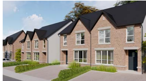
Key Colour: AOIFE (Type A)