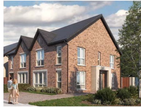
Key Colour A1